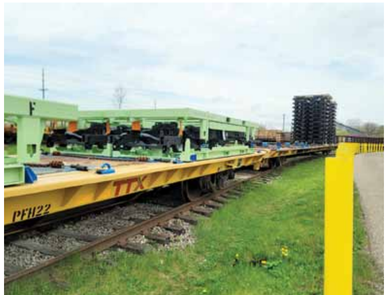
Automobile frames at TTX Waterford facility.