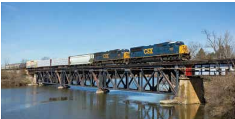
An eastbound CSX freight L303 led by 4757 hauls mixed freight for Lansing and Detroit.