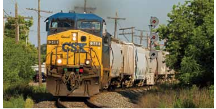
A westbound CSX freight L302 rolls through Howell with mixed freight for Lansing and Grand Rapids.

Moreover, CSX partners with federal, state and local governments on additional infrastructure investments to improve public safety. The U.S. Department of Transportation awarded $24 million