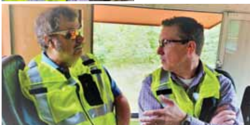
Senators Bullock and Geiss touring Detroit area rail operations.