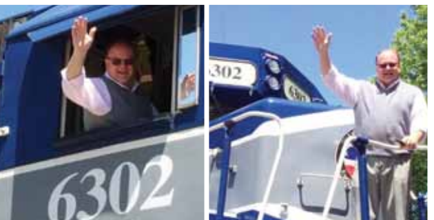
Sen. Jim Runestad toured Lake State Railway operations in Wixom.