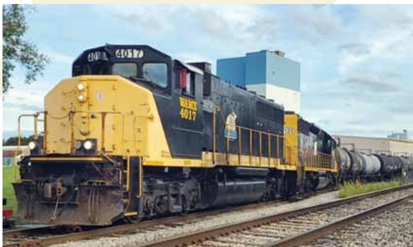
GDLK locomotive 4017 near Wayland.

Watco Companies, which operates 43 short lines around the U.S, started the Grand Elk as their