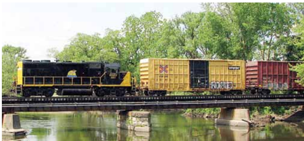
Grand Elk locomotive 501 heading south over the St. Joseph river in Three Rivers.